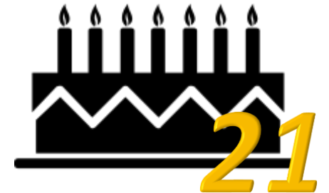
Gala Dinner Recognising the 10 founding members