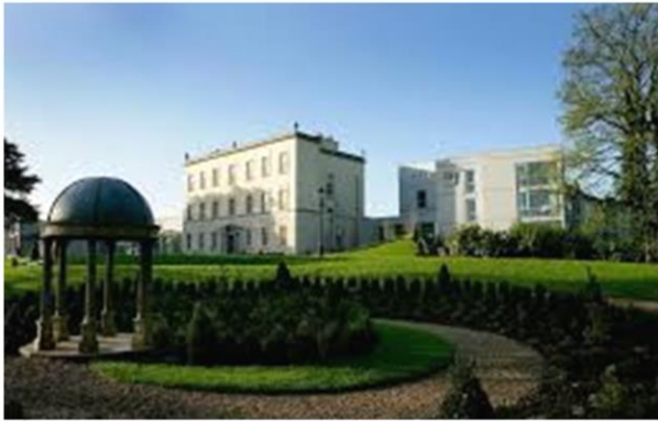
Dunboyne Castle Hotel